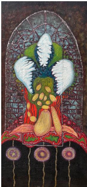
A Tumultuous Time