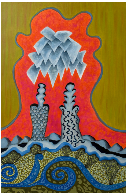
The North Sea