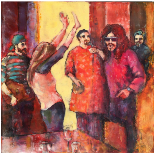
Boxcar Mischief Night #2 12 x 12 inches Encaustic on panel 2017 $2,000