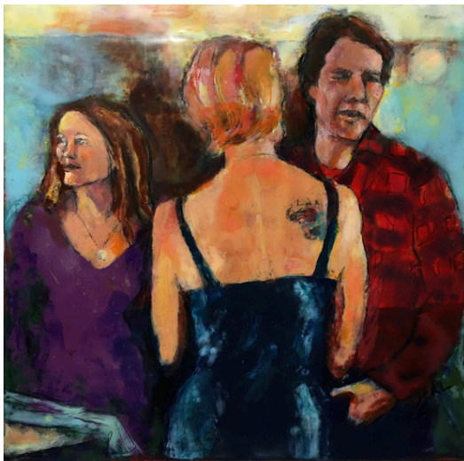
First Fridays #2 12 x 12 inches Encaustic on panel 2018 $2,000