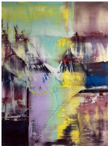
Au Natural 48 x 36 inches Polished Fresco (tinted Plaster) 2024 $5,000