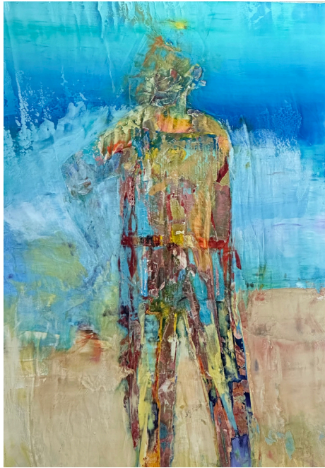
Brake Threw 45 x 28 inches Polished Fresco (tinted Plaster) 2024 $4,000